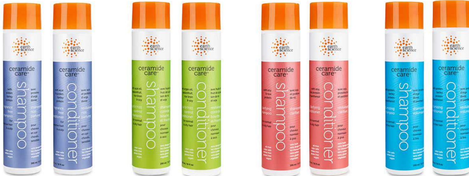
Fragrance Free for sensitive hair & scalp